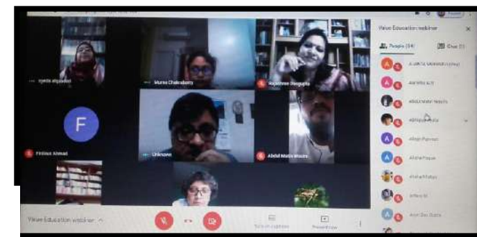
Participants in the webinar