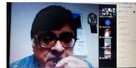
IQAC coordinator addressing the webinar