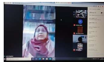
Officer-in-Charge addressing the webinar