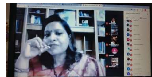
Resource Person addressing the webinar