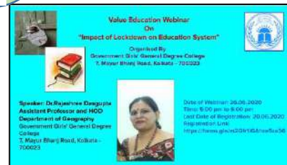
Poster for the webinar