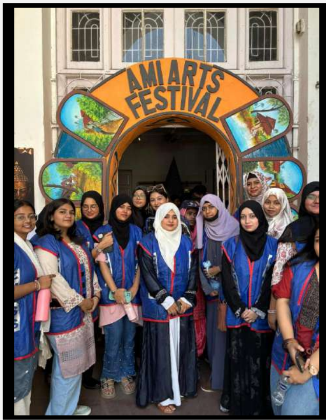
At the entrance of the art exhibition