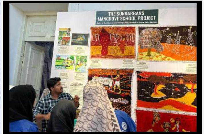
Volunteers are interacting with a person from Sundarbans while presenting their heritage