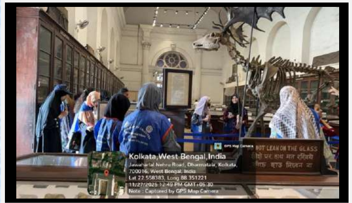
Volunteers are checking out the preserved skeleton of an extinct animal species