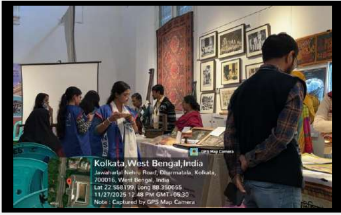
Students are visiting the exhibition