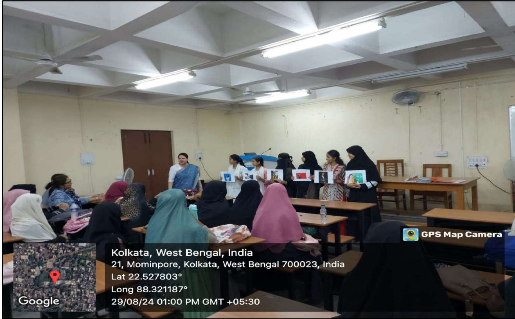
Geo-tagged photo of the event