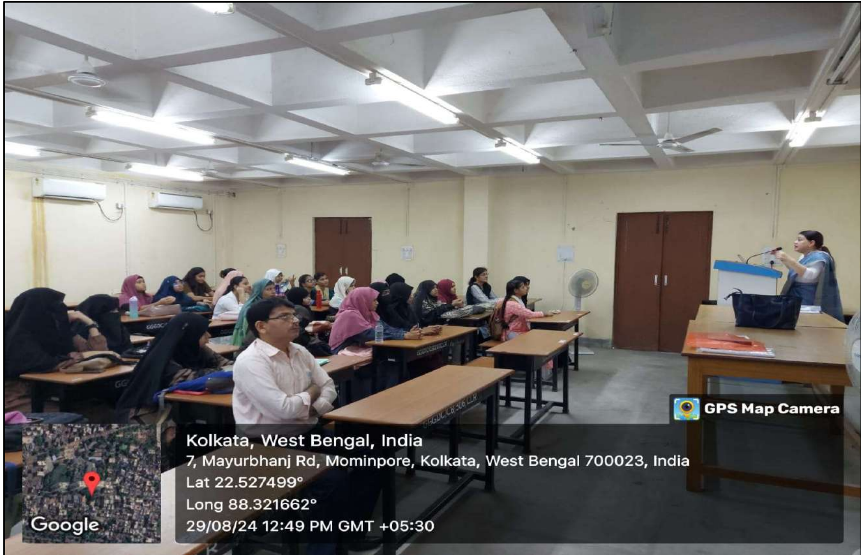
Geo-tagged photo of the event