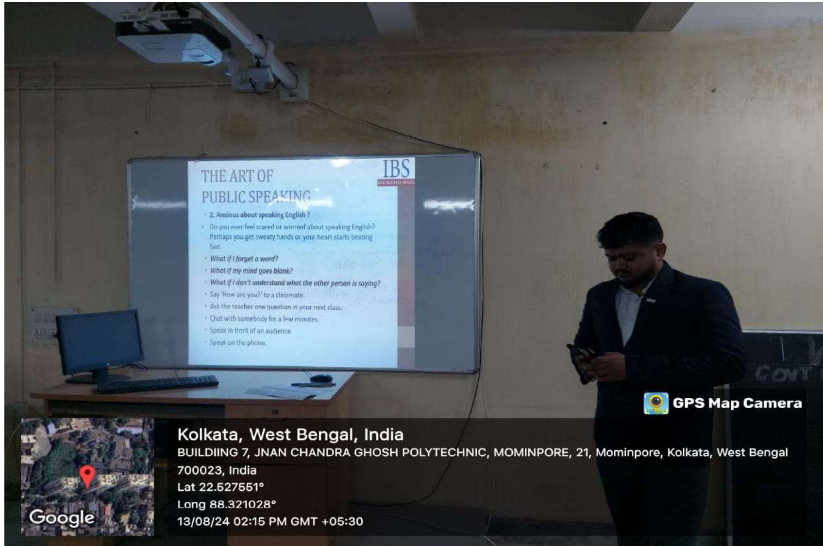
Geo-tagged photo of the lecture